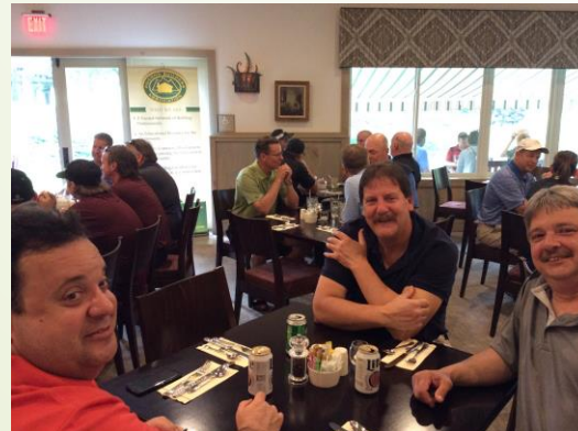
The group enjoying dinner after the tournament at Buck Hill Golf Course